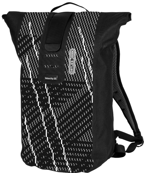
Design „Digital Erosion“, 23 L