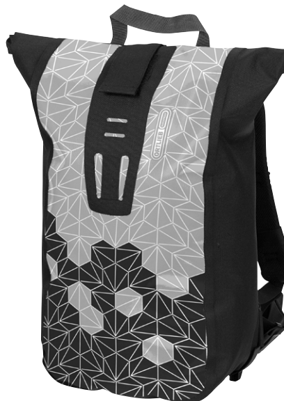
Design „Prism“, 17 L