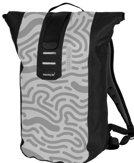
Design „Maze“, 23 L