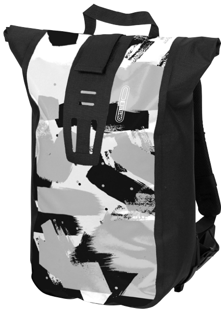
Design „Patchwork“, 17 L